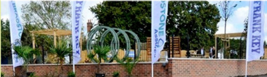
Floralands Garden Village, Catfoot Lane, Lambley, Nottingham NG4 4QL

Looking for ideas for your garden? A visit to the largest Bradstone Paving display in the UK at our site at Floralands Garden Village could give you the inspiration you are looking for.