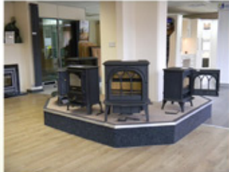
Showroom Nottingham Road, Daybrook

for all your Building, Landscaping & Timber supplies