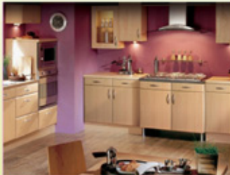
Showroom Mansfield Road, Daybrook

Planning a new Kitchen or Bathroom or just looking for a specific item then visit our extensive showroom. We can help with design, product selection and fitting