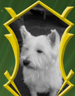
'Alfie' as Toto (in Kansas)